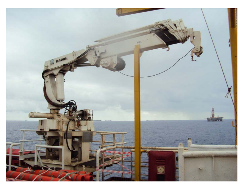
Crane following incident

A member has reported an incident in which a crane winch wire parted and the hook block was dropped to deck. The incident occurred when the crane operator began to extend the jib of the crane without letting out the winch wire at the same time. The extending jib caught the hook block and caused the crane winch wire to part. The hook block, which weighed 30kg, dropped 10 metres (m) to the deck. There were no injuries.