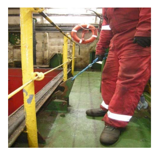
Showing rope tail in use (making manual handling unnecessary)

An investigation revealed the following: