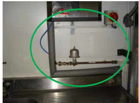
The permanent solution

Our members' investigation noted the following: