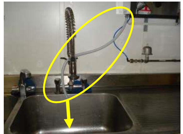
Above – vent tube and exit to sink