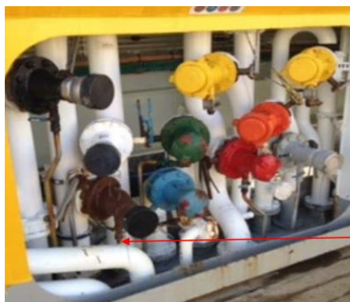
Port mid-ships hose bay & fuel sample/drain cock location

The company investigation revealed that: