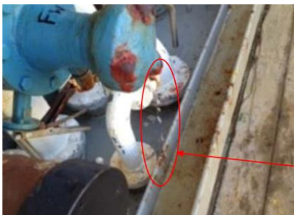
Port mid-ships fresh water manifold showing water leaking from the cap.

fuel in the water between the vessel and quayside. SOPEP equipment was deployed and booms put in place around the vessel to contain the fuel.