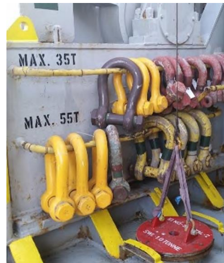
Corrective action: rearranging the shackle racks, to place heavier shackles at the bottom.

Our member's investigation revealed the following: