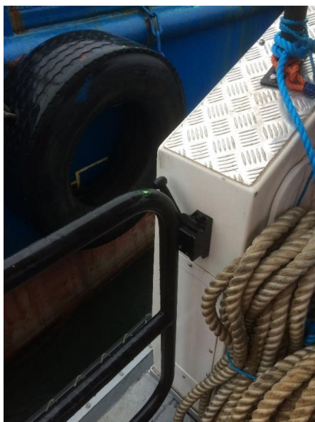
Starboard gate (closed) and latch.

The alarm was immediately raised, assistance given and the crew member was recovered safely within 30 seconds of falling into the water. The crew member was wearing a floatation suit and a life jacket – which self-inflated following immersion. The crew member received no injuries, required no medical or first aid treatment and did not require re-warming. Once recovered inboard, the crew member changed into dry clothes, was issued a dry floatation suit and a replacement lifejacket. He declined a hot drink offered to him. Work was stopped, latches were tied shut and the vessel returned to port and an investigation was started.