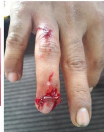
Showing shackles, gloves and injured finger.