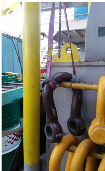
Corrective action: use of lifting equipment and strops for all future manual handling exercises involving heavy loads.