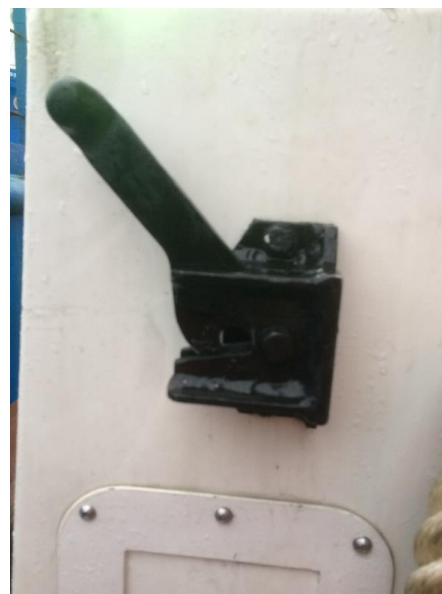
Close up of latch.