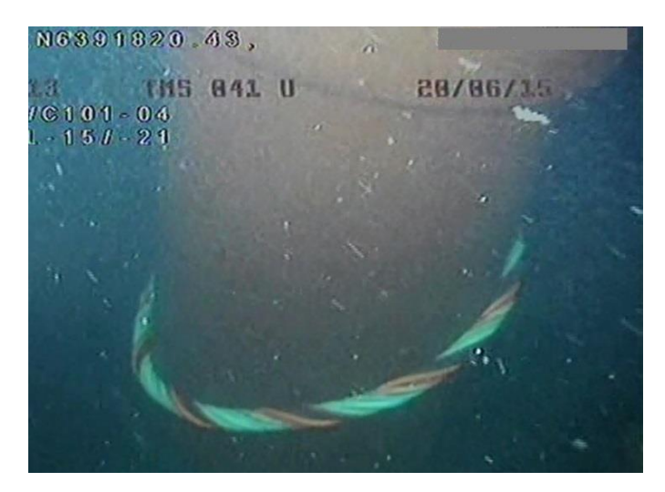
Camera view of fouled umbilical.

Our member noted the following contributory or underlying causes: