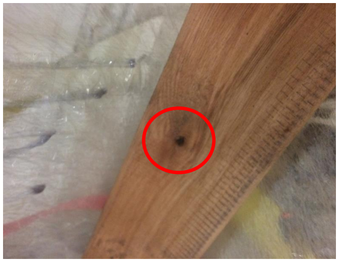
Showing knots in the steps (circled)