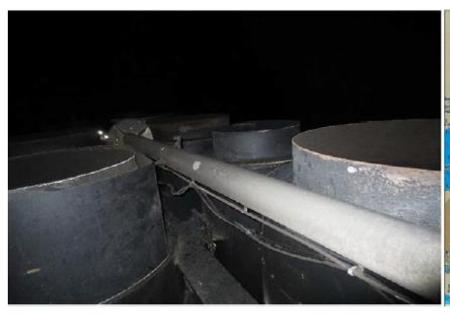
Mast resting between the stacks

A member has reported an incident in which the aft mast of a vessel struck an overbridge and broke, damaging the navigation lights on the mast. The incident took place during a transit of a ship canal in the United States. The aft mast of the ship struck the lower span of a raised vertical lift railway bridge. The aluminium mast post broke just above the base. As a result, the navigational lights on the mast post were damaged beyond repair. The mast fell safely on the funnel top and no persons were injured. The local United States Coast Guard (USCG) Captain was notified of the incident and the vessel continued to its next port of call, where repairs were conducted.