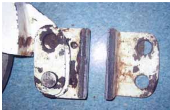
C clamp retaining bracket (after failure)