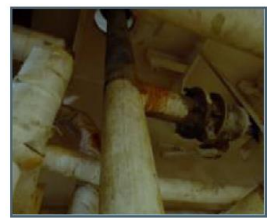
The pipe seen from the lower deck – where the fitter was working