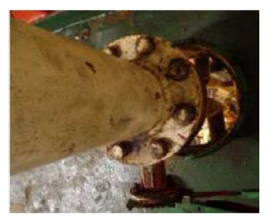
The pipe and the opening through which it had to be lowered. Two helpers were at this location. This was one deck above the fitter's location