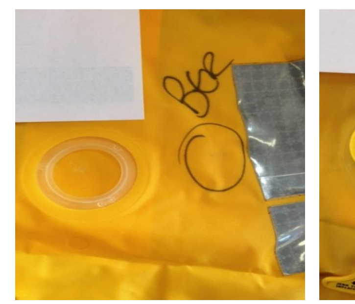
Showing location of damage to bladder

The manufacturer informed their buyer that the damage was due to pressure applied to the front of the jacket when in use. This was causing the folded bladder to press up against the 'Hammar' automatic inflation device within the jacket, which in turn was causing damage to the bladder. The manufacturer is now fitting rubber covers to the automatic inflation device.