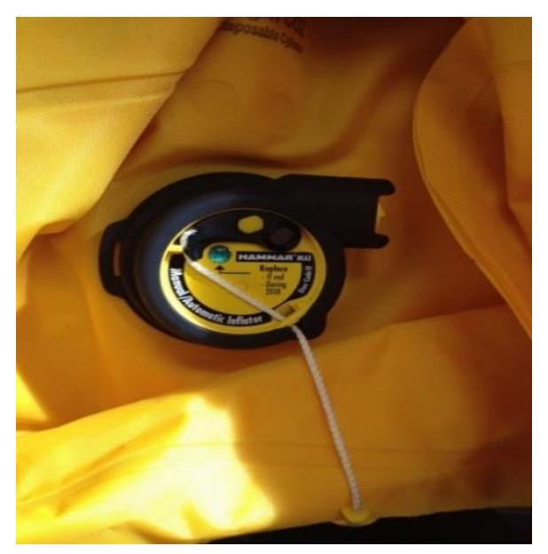
With new rubber cap fitted