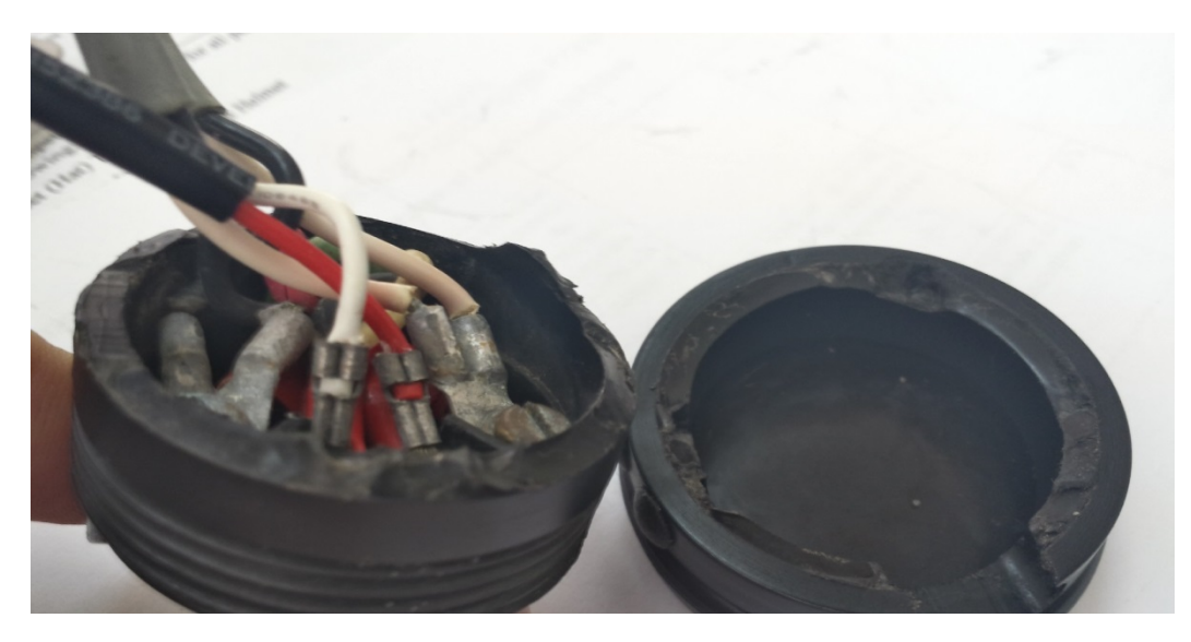
Figure: showing broken helmet communications module

Our member's investigation revealed the following: