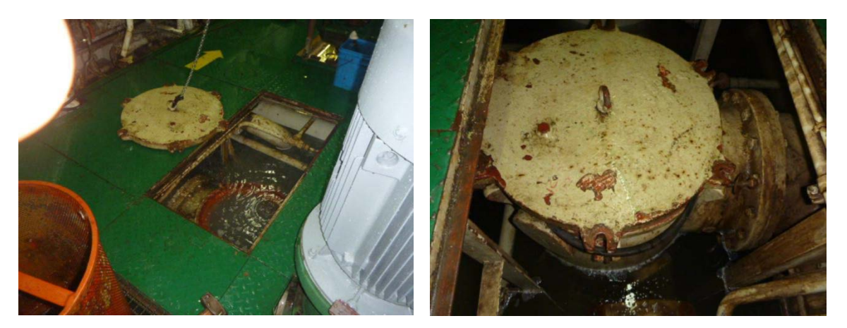
Figures: showing flooding (left) and cover plate of sea strainer (right)

A member has reported an incident in which the engine room of a seagoing vessel was flooded to a level of two metres above tank top (to just below the engine room floor plating). Had the flooding incident lasted a few minutes longer, serious machinery damage could have been the result. The incident occurred during ballasting operations, when the configuration of pumping from and to ballast tanks was altered. During this process the cover plate of the sea strainer was blown off. This resulted in seawater ingress into the engine room. Engine room personnel instructed the bridge officer in charge of ballasting to stop ballasting operations (without mentioning reasons). As per company procedure, the overboard suction valve and overboard discharge valve were opened to 'de-energize' the pumping system. This worsened the situation since a direct connection between open water and engine room was created. This was noticed by engine room personnel immediately and the bridge officer was instructed to close overboard valves. There was no damage and no injuries.