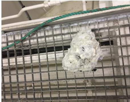
Crystallised white mass

A member has reported an incident in which there was contamination of liquid cargo on an offshore support vessel. The incident led to a week-long cleaning operation in which a number of crew became ill and had to take time off work to recover. The incident occurred during loading of 50 cubic metres of calcium chloride brine. As loading started, it was swiftly noticed that no cargo was being received into the tank. The manual valves in the brine system were checked, and it was verified that they were open as they should be. When the loading line was connected to another (amidships) manifold to attempt loading from there into the tanks, the same situation was experienced and no cargo received into either tank. The suspicion arose that the line might be blocked, and it was decided that the loading had to be stopped. To assess the problem, dismantling of the line was started. When the lines were opened it was found that the calcium chloride brine had turned into a crystallized white mass, in some places completely packed in, and further into the line system, at the aft crossover line, a gel-like mass, blue-greyish in colour, was discovered, which in a tray formed a thicker mass setting to the bottom with a more fluid version on the top.