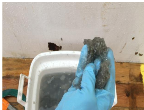
Blue-grey gel-like mass