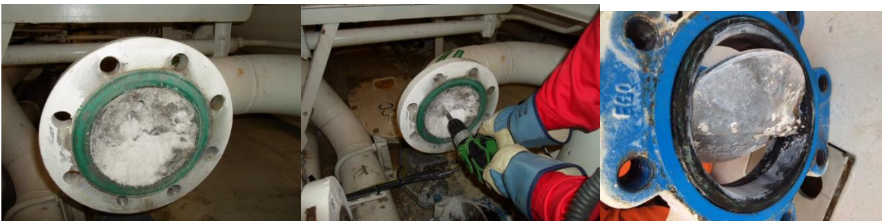
The opened lines revealed a crystallized white mass that blocked the system

The subsequent unexpected task of dismantling, cleaning and reassembling the pipes took over one week, involving work from both vessel crew and outside contractors. It had a negative but temporary impact on the health of some personnel involved. At the end of the cleaning period, some of the vessel personnel involved in the dismantling of the line system reported the following symptoms: