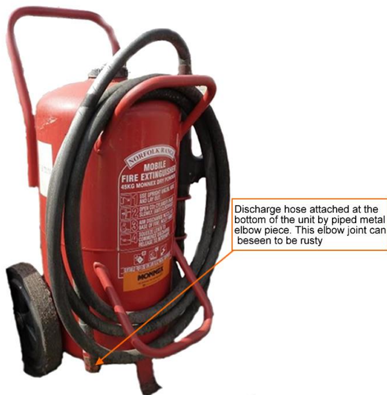
Type of large dry powder extinguisher affected

More detailed information is available from the UK HSE: http://www.hse.gov.uk/safetybulletins/norfolk-large-wheeled-dry-powder-fire-extinguishers.htm .