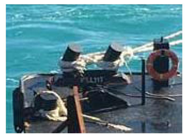
Incorrect mooring technique and pulling angle

As a result of the loss of control, the cargo barge and our member's vessel came into collision; however, there was no damage. There was no risk of injury to personnel during the incident.