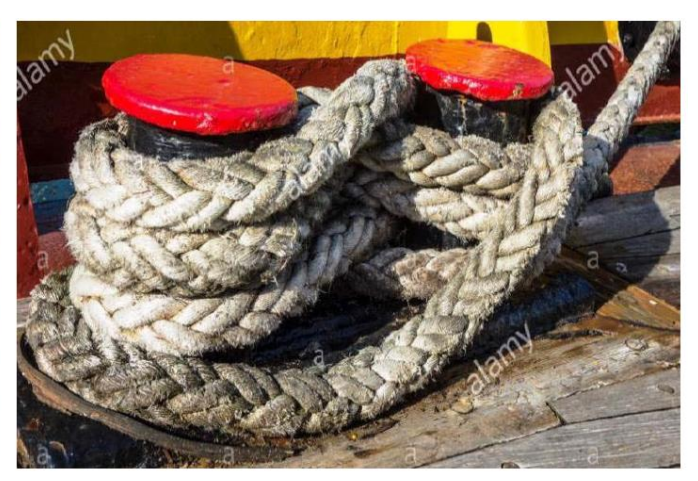
Example of correct mooring technique to prevent 'slipping off