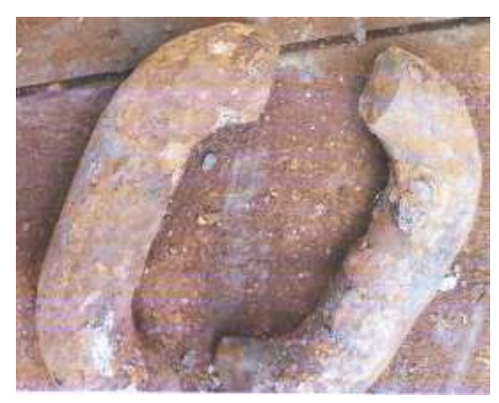
Chain link failure