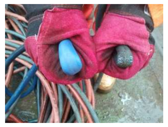
Right: difference between new and old hoses