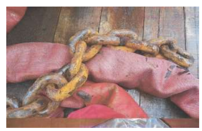
Chain link and protective cover

A member has reported an incident in which a chain parted during the recovery of a hyperbaric lifeboat (HLB) during routine testing and maintenance. On recovery of the HLB the vessel crane started the lift and when the weight on the crane load readout was approximately 7 tonnes, one leg of the chain set parted when two links split through their link ends. Since the HLB had not yet been fully lifted out of the water the drop was minimal and the parted chain dropped back onto the top of the HLB. There was no damage to the HLB shell due to the soft covering over the chain links.