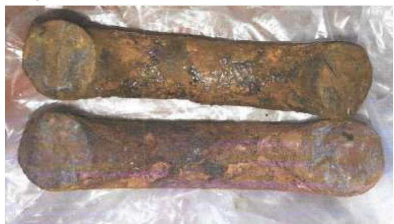
Corrosion on cross section of failure zones