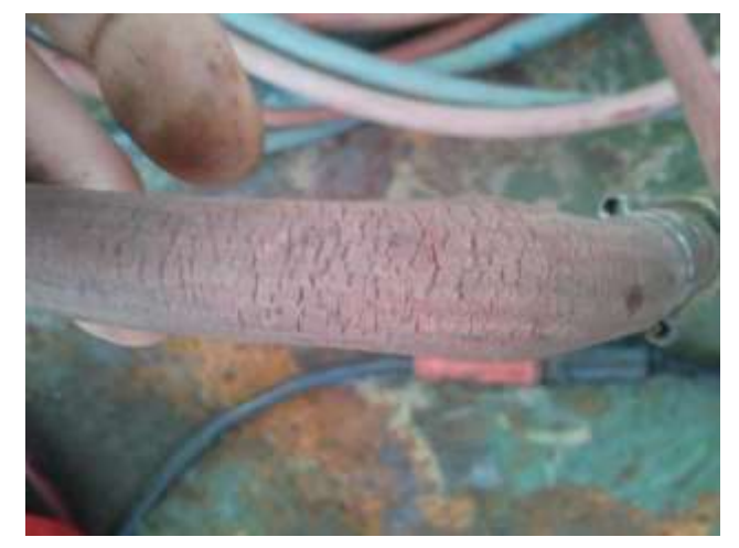
Left: work-hardened and perished hoses

A member has noted a number of incidents resulting in fires caused by perished hoses and flashbacks involving oxyacetylene cutting equipment, and has shared the following information with IMCA for use as part of a safety flash.