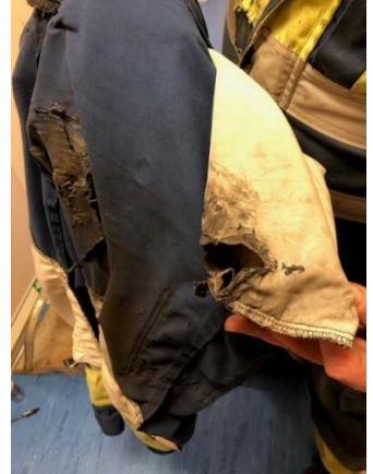
The pocket – burnt through

degree – temperatures estimated at approximately 1000 °C