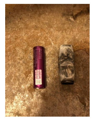
The exploded battery and the one it was supposed to replace if required.

The metal keys created a short circuit with the battery. Carrying the battery in his pocket with the keys enabled the keys to provoke a 'thermal runaway' by either puncturing the outer shield or by making a connection between the plus and minus layers; the exact cause could not be determined conclusively.