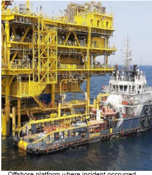
Offshore platform where incident occrurred, with workboat alongside (moored to boat-landing)

The officer on watch witnessed the incident from the vessel bridge and raised the alarm; a deck AB responded by manually recovering the partially submerged person to deck. He was wearing a three-piece foam floatation device, and all required personal protective equipment (PPE) including a helmet with chinstrap correctly worn.