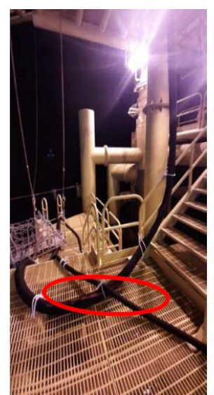
Position of temporary hoses at incident scene

Whilst descending stairs to a boat-landing area on an offshore platform, a sub-contracted employee of one of our members tripped on a 2-inch discharge hose that had been laid across the base of a stairway. He fell forward onto the boat landing, momentarily arresting his forward movement, before tumbling into the gap between the boat landing and a moored workboat. He was able to break his fall by grabbing a fender chain attached to the workboat. The fall injured him (it was a restricted work case) however it is clear that there was potential for the outcome to be more severe.