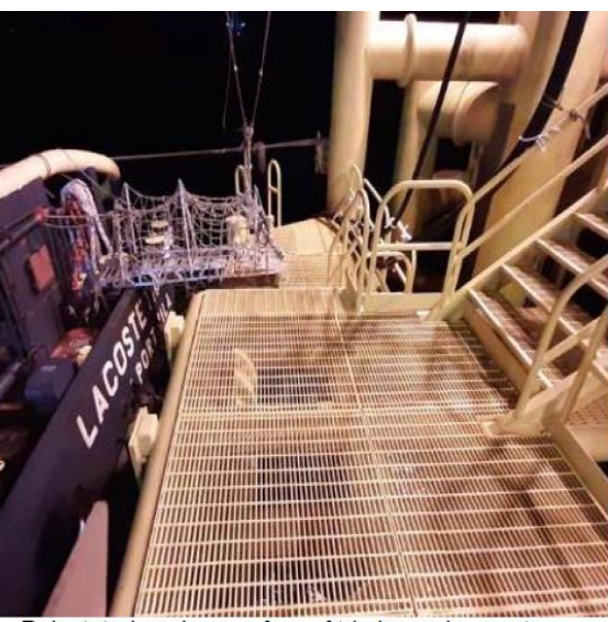
Reinstated work area, free of trip hazards - post incident event