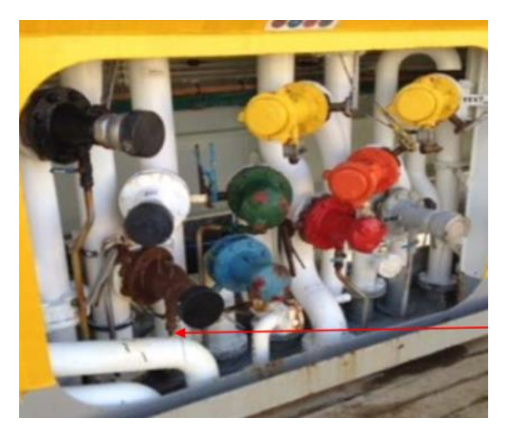
Port mid-ships hose bay & fuel sample/drain cock location

The company investigation revealed that: