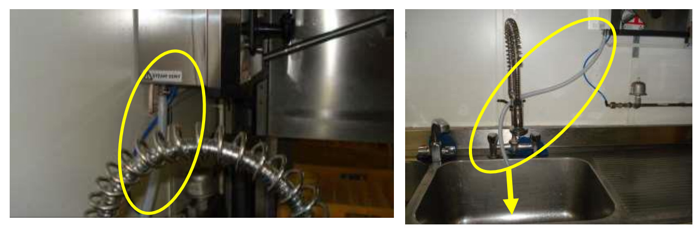
Above – vent tube and exit to sink

A member has reported an incident in which a person was scalded when working in the kitchen/pantry area onboard a vessel. The incident occurred when the injured person was rinsing dishes in the ships pantry, near a boiler. The boiler exhausted steam through a vent pipe, and so a plastic tube was retro-fitted to the vent, allowing any condensate to drain into the sink in which the dishes were rinsed. Steam vented from the boiler and the condensate ran down the tube, exiting the pipe in to the sink and coming in to contact with the injured person's right forearm. He immediately ran cold water over his arm and reported directly to the medic who carried out first aid.