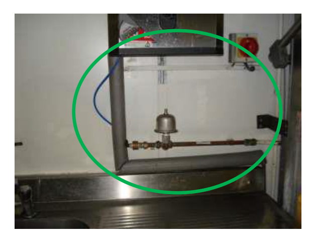
The permanent solution

Our members' investigation noted the following: