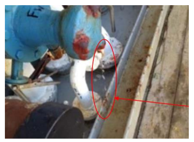
Port mid-ships fresh water manifold showing water leaking from the cap.

fuel in the water between the vessel and quayside. SOPEP equipment was deployed and booms put in place around the vessel to contain the fuel.