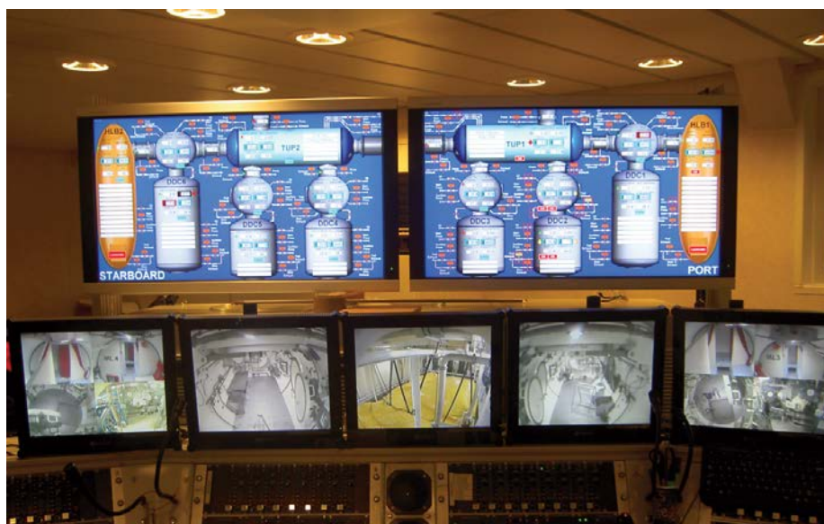
A saturation diving control room

Re-evaluation and revision of the two IMO diving instruments will ensure that suitable diving systems incorporating appropriate HES