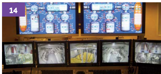
IMO on safety for diving systems and autonomous surface ships