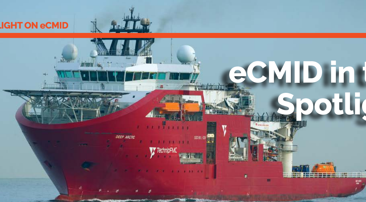
TechnipFMC's Deep Arctic has a live eCMID report