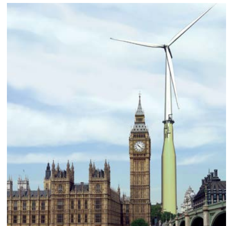
A visual comparison of the Hywind turbine with the Elizabeth Tower in London, home of the famous Big Ben.

Success with the Hywind demonstrator gave confidence in the technology and enabled progress to the next stage of deployment.