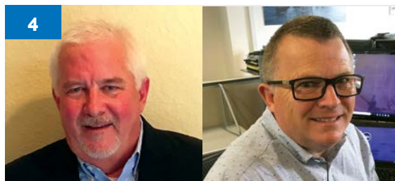
New IMCA appointees