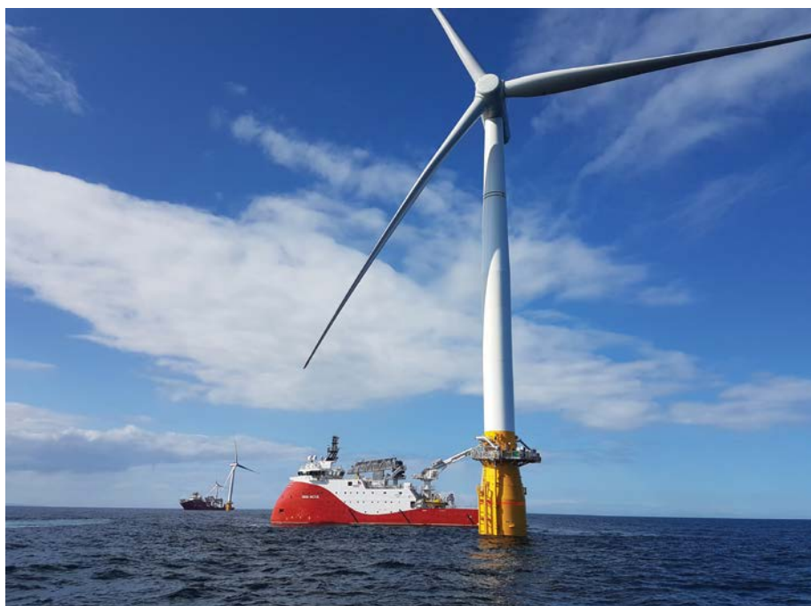
ISV Siem Moxie on Hywind