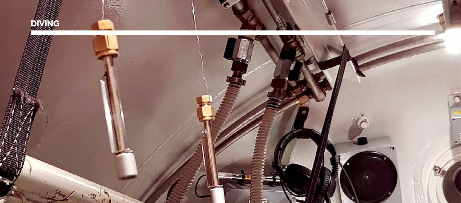
Sampler tubes hanging in a diving chamber