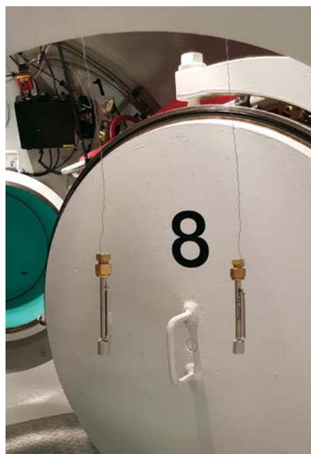
Hyperbaric passive sampling tubes contrasted with traditional pressurised sampling flasks