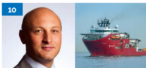
Spotlight and update on eCMID