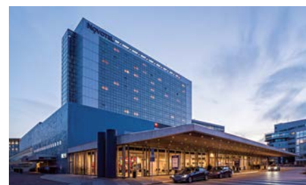
The World Forum in The Hague is a suitably prestigious venue for the return of IMCA's Annual Seminar

Full details and registration are at imca-int.com/annualeseminar