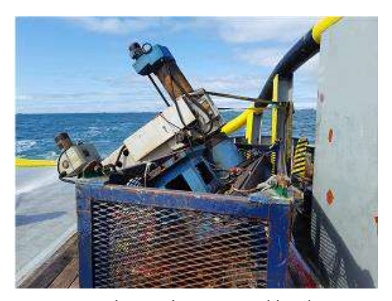
Basket with unsecured load

A cargo basket containing equipment was to be lifted from the vessel deck to an offshore installation. The crane on the offshore installation was unable to lift the load, resulting in the basket dropping back to deck and some of the equipment sliding out the basket onto the vessel deck.