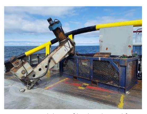
Equipment slid out of basket during lifting