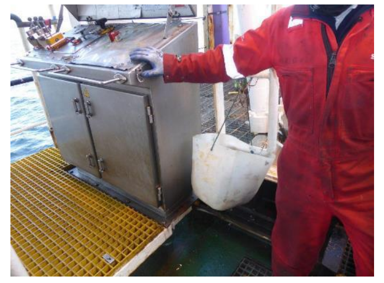
The injured person had been descending the raised platform and placed his hand on the console to steady his descent