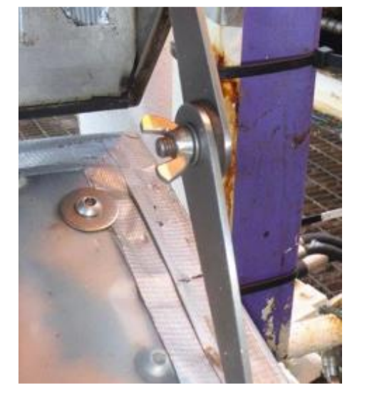
Hinged mechanism was retained by two unsecured wing nuts