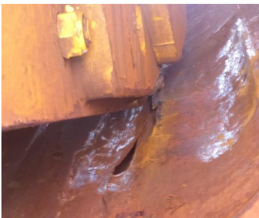
Internal condition of crane pocket