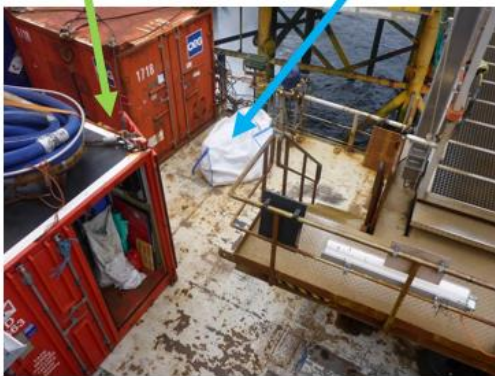
Location of incident