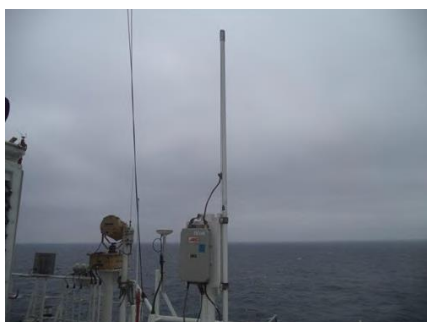
SSB antenna above bridge

Our member notes that this incident could have had a much more serious outcome had one of the base plates dropped from a height.