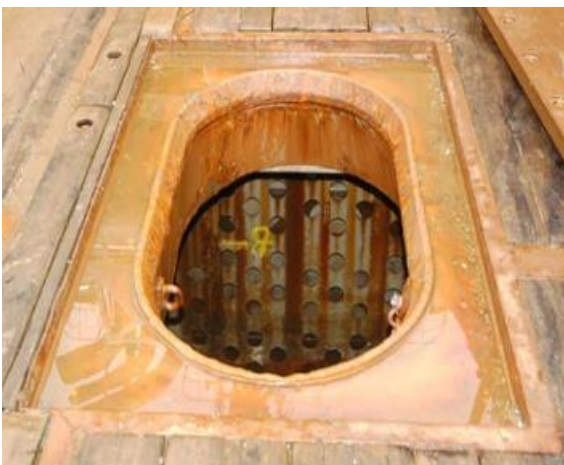
A similar hatch