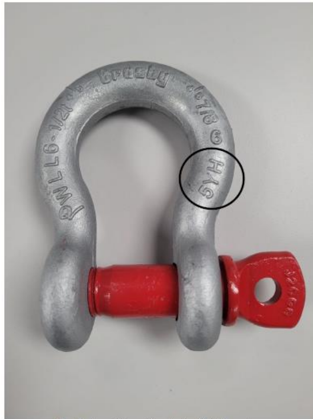
Production Information Code (PIC) Location